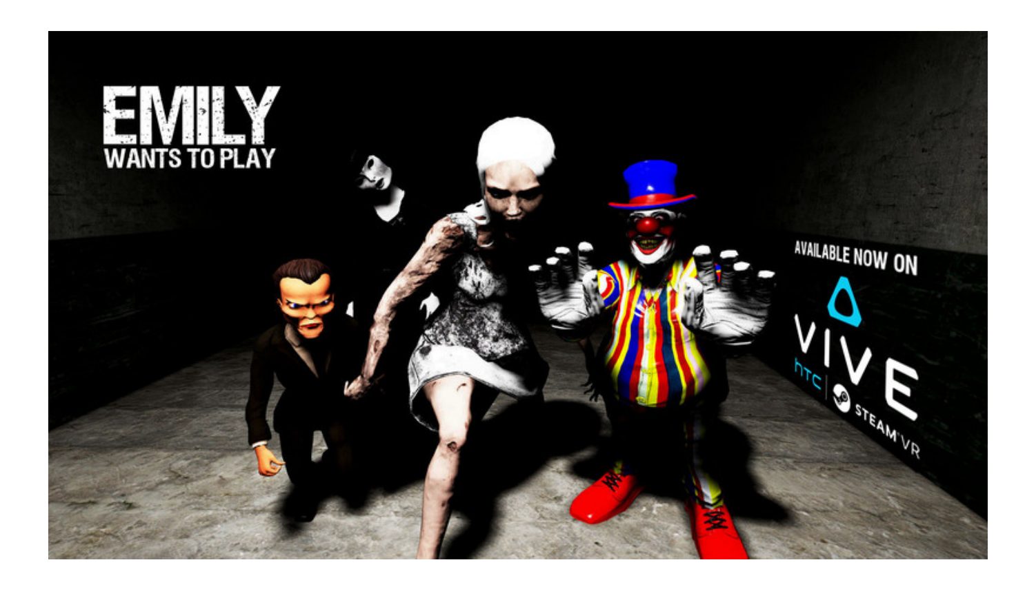
Download ->->-> <a href="http://bit.ly/2NF7avN">http://bit.ly/2NF7avN</a>

Download HUBE: Seeker Of Achievements .exe